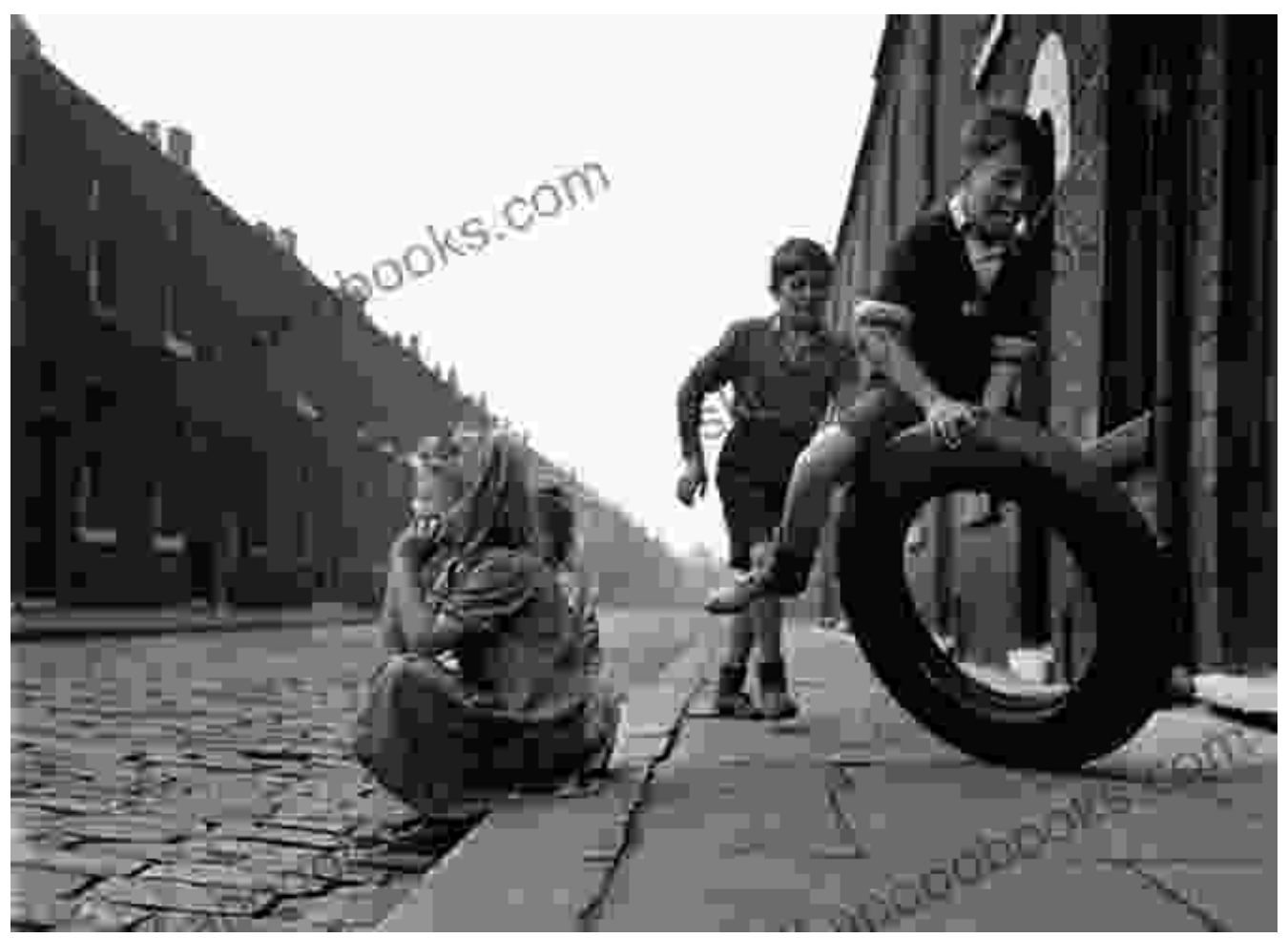
Historical and Cultural Insights

Beyond the personal narratives, "Children of Vallejo" also serves as a valuable historical and cultural document. The stories provide a unique window into the development of Vallejo, from its early days as a shipbuilding hub to its transformation into a diverse and thriving community. Readers will gain insights into the social, economic, and political forces that have shaped the city over the decades.