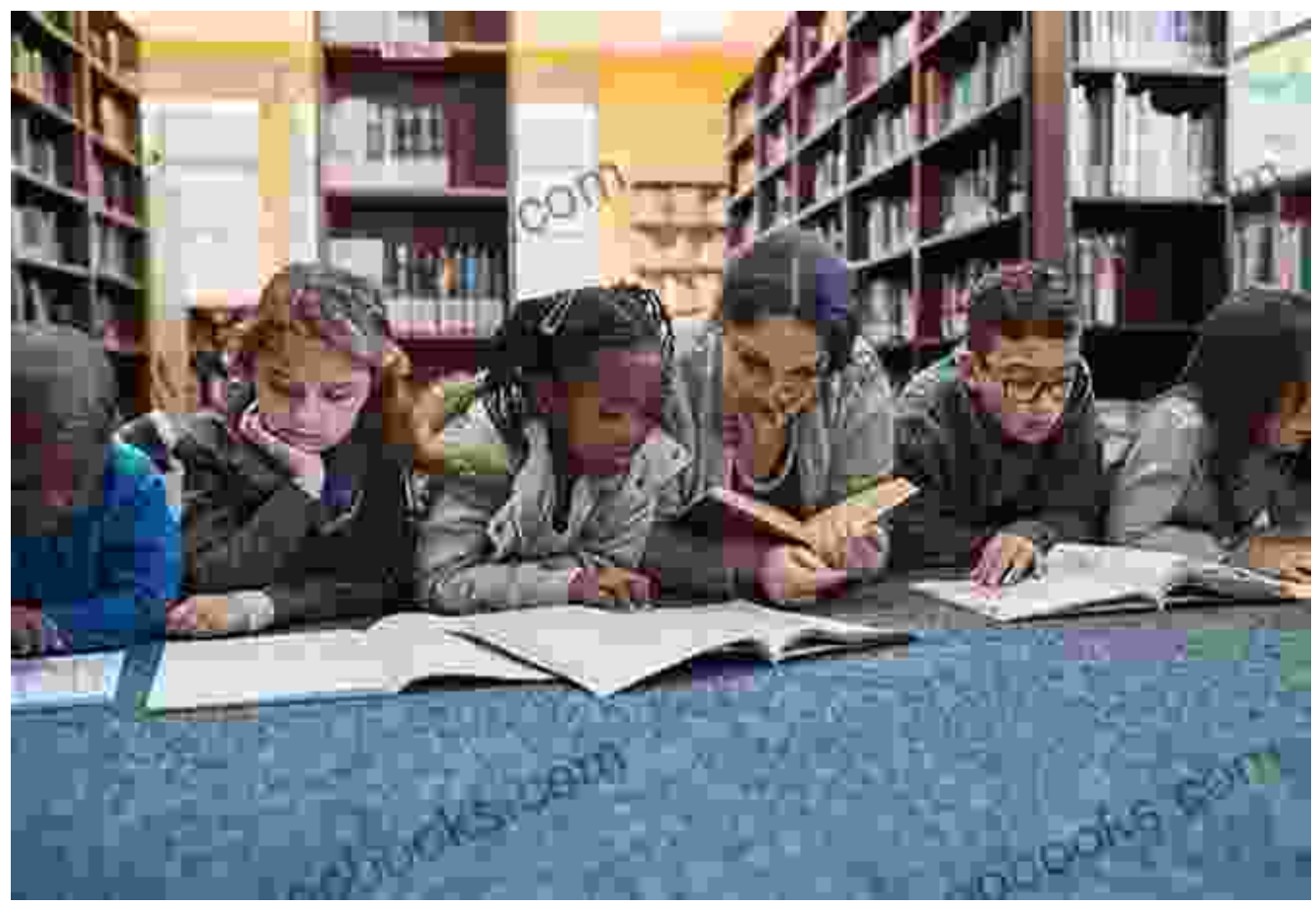
Praise for "Children of Vallejo"

teaching tool, a source of inspiration, and a reminder of the importance of preserving our collective stories.