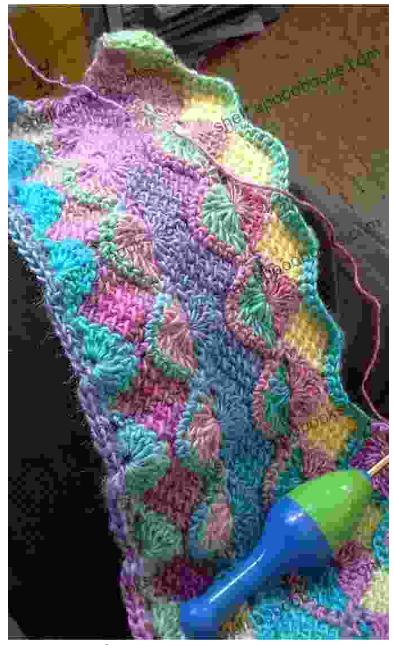
Embark on a Journey of Creative Discoveries

Step into a realm where creativity knows no bounds. Within the pages of this book, you'll find a treasure trove of patterns and projects that cater to a wide range of skill levels, from beginners eager to embrace the craft to experienced crocheters seeking inspiration for their next masterpiece.