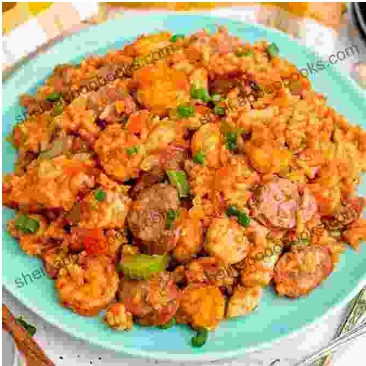
Louisiana's A-Z Something Extra: Lagniappe (Louisiana's A-Z Something Extra Series Book 1)