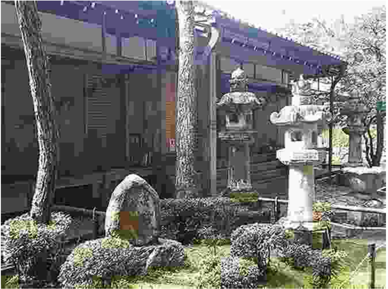
Shosya Enkyo Temple, Kyoto, Japan - The lecture hall, known as the Hojo, is a smaller building located behind the Kondo.