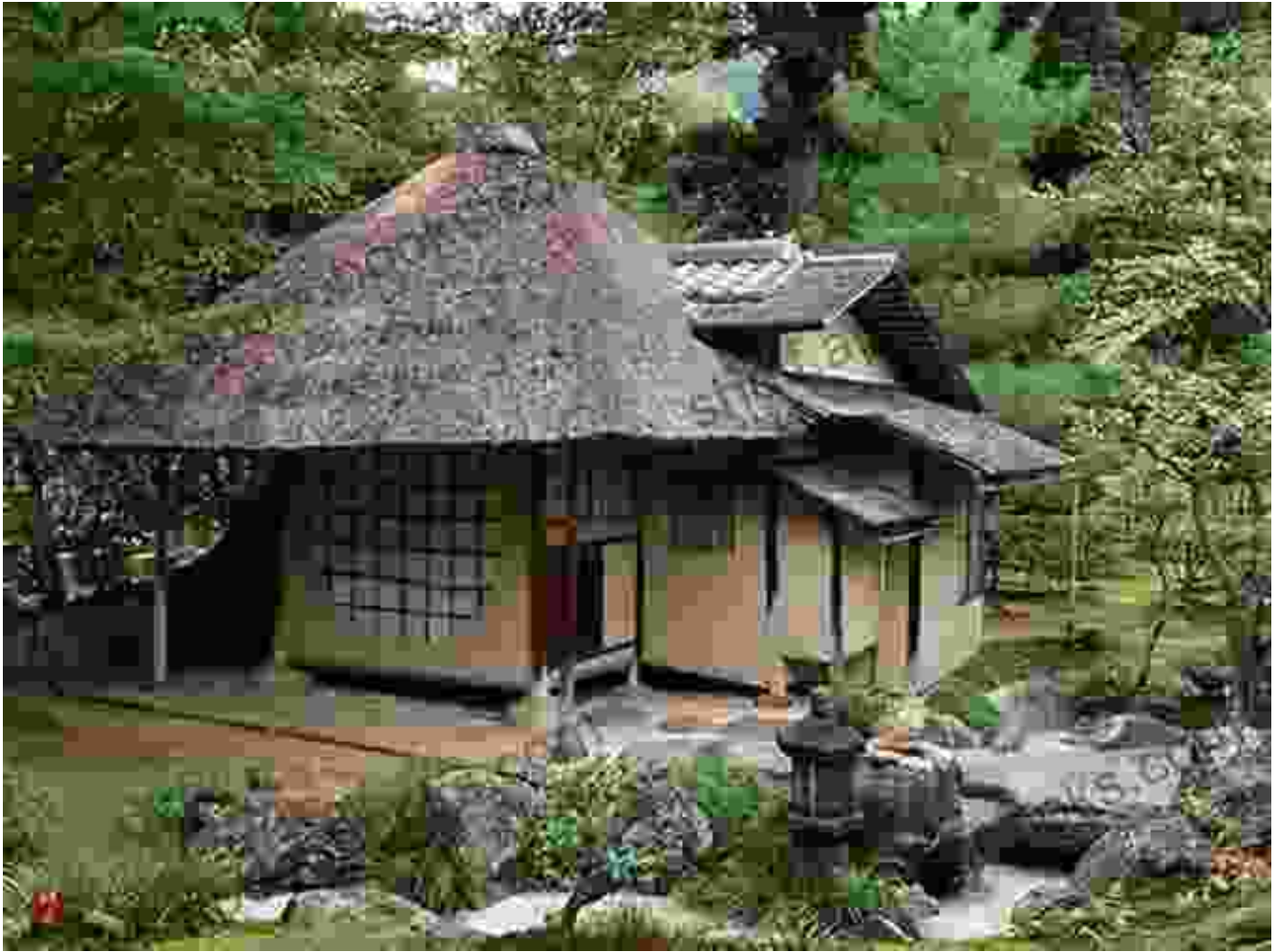
Shosya Enkyo Temple, Kyoto, Japan - The tea house, known as the Chashitsu, is a small, traditional building located in the temple garden.