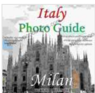
Italy Photo Guide: Milan: Photo Travel Guides to Tourists and Travelers Planning their Trip (The Virtual Traveler Book 1) by Simona Iacob