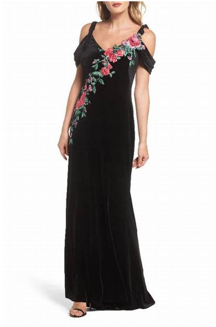
Image Description: A stunning evening gown adorned with an exquisite appliquéd floral design, the delicate petals and leaves cascading down the bodice, creating an ethereal and captivating look.