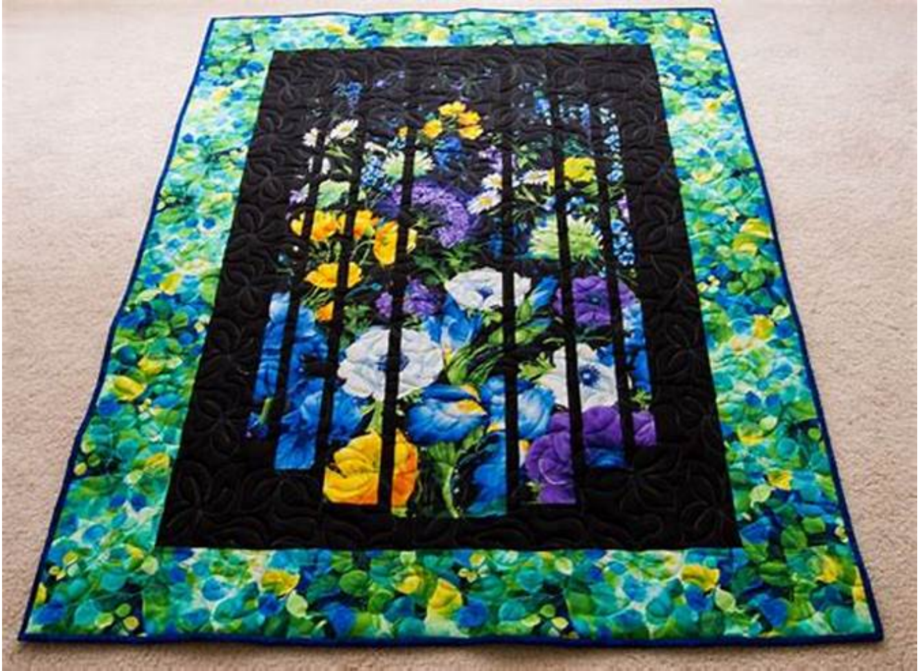
Image Description: A close-up of a beautifully stitched appliqué quilt showcasing an array of vibrant floral motifs, each petal and leaf meticulously sewn onto a contrasting background fabric.