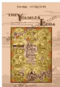
Image of the book cover, showcasing its intricate design and evocative imagery, inviting the reader to dive into the realm of Norse mythology.