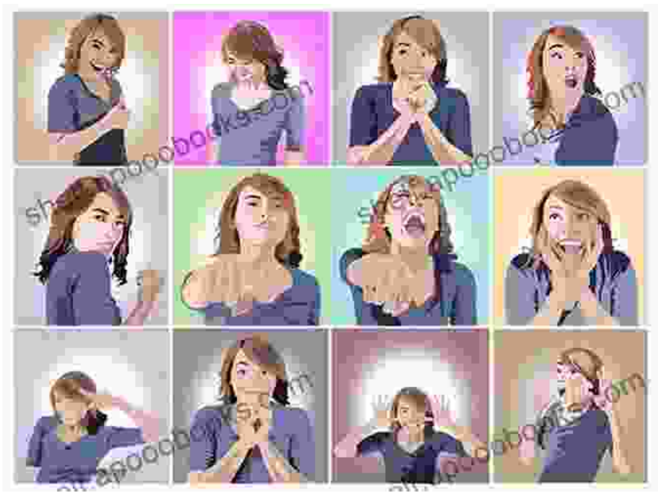
Understanding the Subtext: The Unspoken Words

Unlike men, who tend to be more direct in their communication, women often favor an indirect approach. They may hint at their desires, express their emotions through subtle cues, or use body language to convey their true intentions. This indirect style of communication can be challenging for men to navigate, leading to misunderstandings and frustration. By understanding the art of indirect communication, you can gain a deeper insight into her thoughts and feelings, avoiding the pitfalls of misinterpretation.